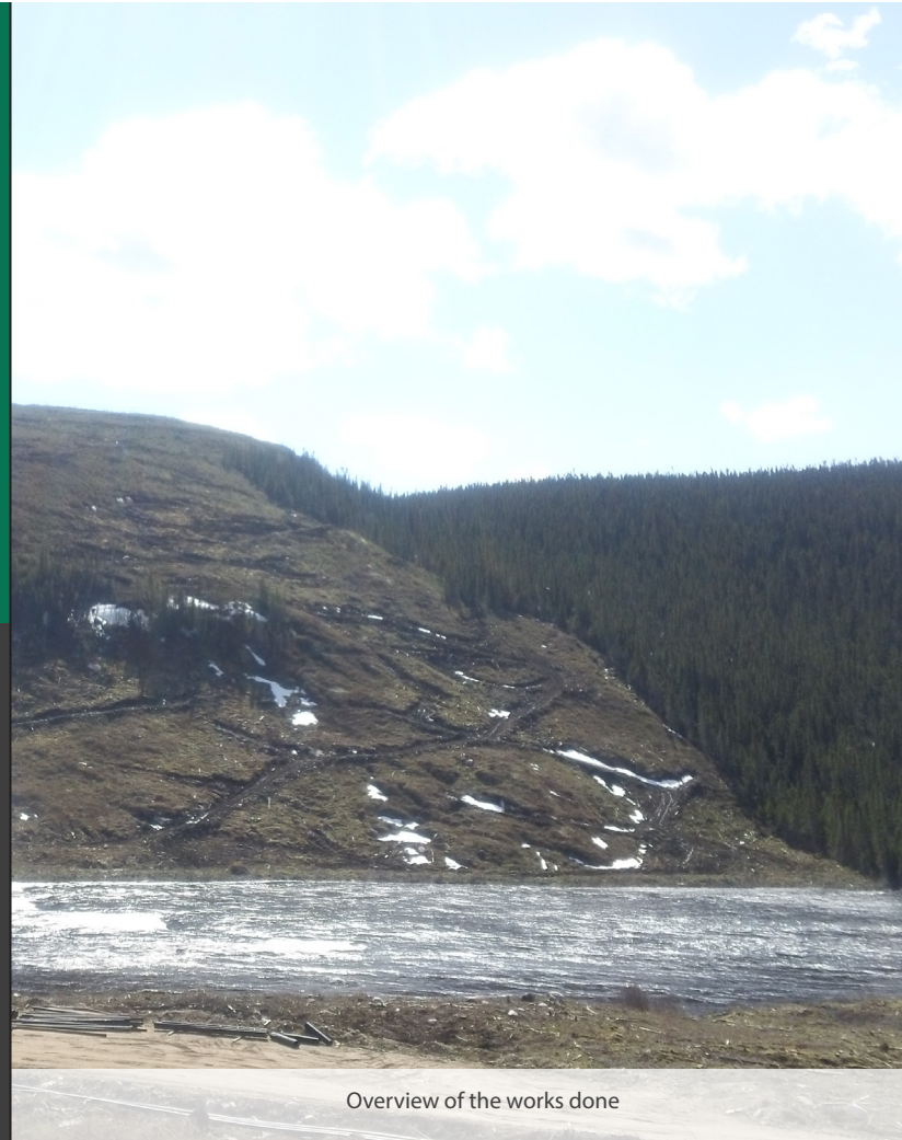
Overview of the works done

Aboriginals: 21 780 hours (31 % of the total worked hours)